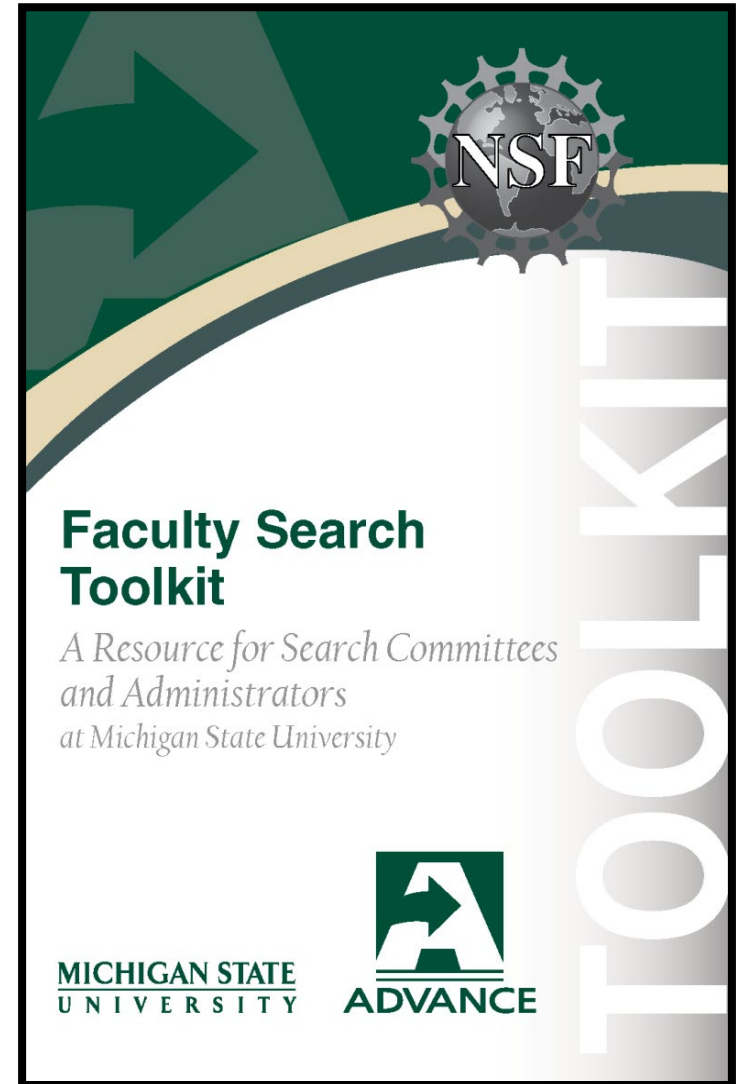
Faculty Search Toolkit